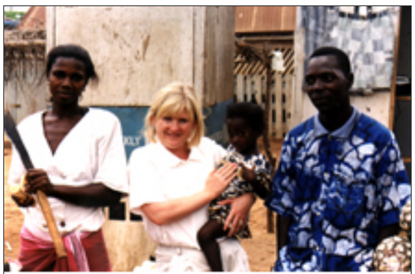
Local sugar cane merchants and their daughter in my arms. Sweet.